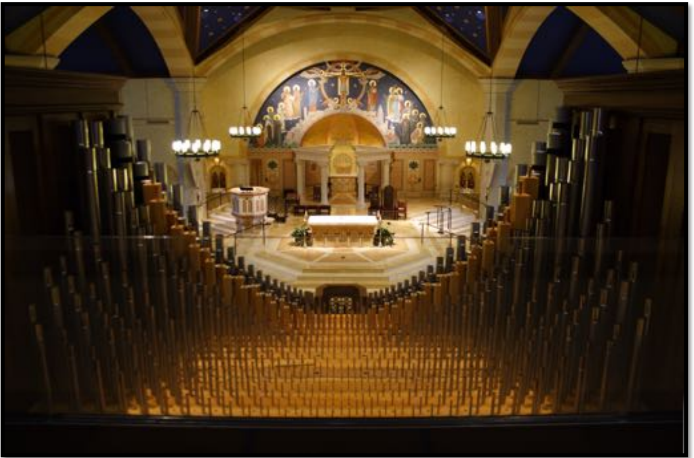
The view of the Sanctuary from behind the Rail Division.