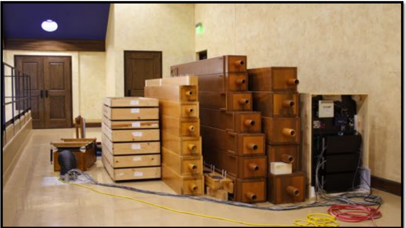
Prior to the installation of the organ, the largest pipes were hoisted over the choir loft rail and stored behind the choir risers. Note the temporary reservoir and blower connected to the ductwork (lower left) in the floor. At the time of this picture, the Rail Division had been installed and was playable from the Console.