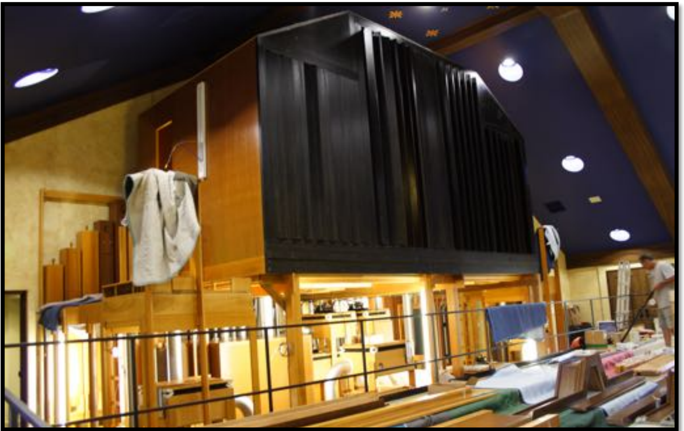
ABOVE: The entire instrument including blowers, reservoirs, and wind lines are enclosed in the Main Case. The pipes sit in the black chamber-like boxes above the mechanics. These boxes have shutters that open and close to control volume. The largest pipes stand against the back wall. BELOW: The finished Main Case.