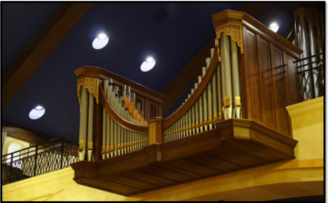
Inside the towers of the Rail Case sits the 8' Trompet, 1-4 of the 8' Principal, and 1-8 of the 8' Holz Gedeckt. At 12 stops (4 of which are 8' Ranks), this Rail Division is the largest in Central Ohio.