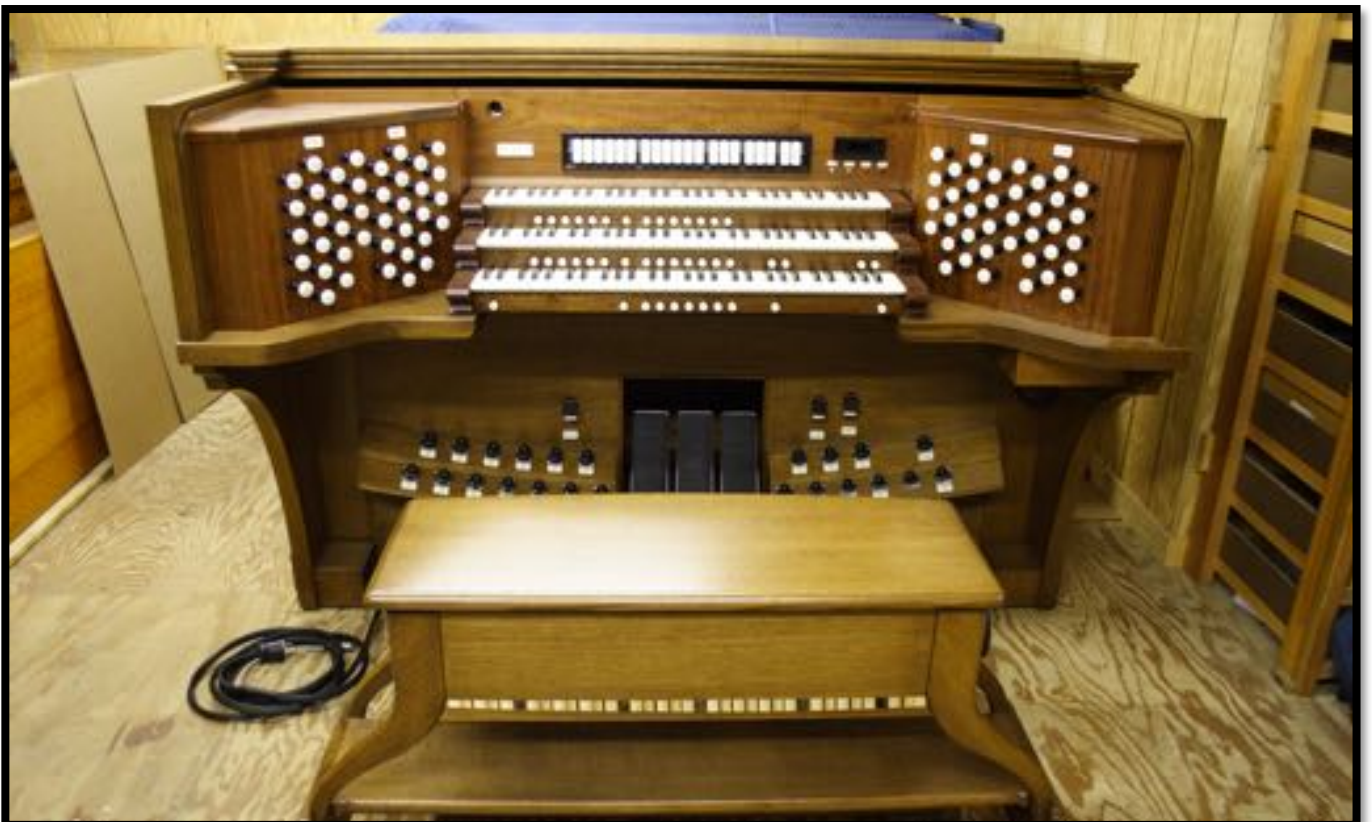
The low profile Console as it appeared (without the music rack) at the Muller Pipe Organ factory.